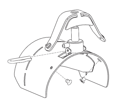
Figure 4. Brace removal Remove Allen key fixings. Lift upwards for removal

Remove Ratwall brace if uneven benching prevents an easy installation